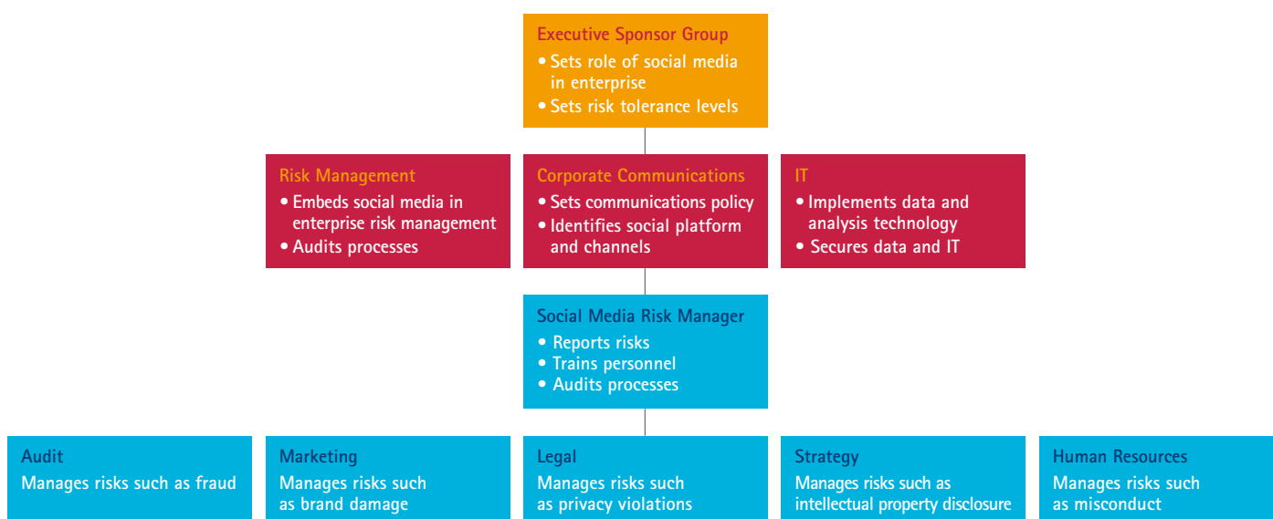
FIGURE 2: AN ILLUSTRATIVE EXAMPLE OF A SOCIAL MEDIA RISK MANAGEMENT GOVERNANCE AND ACCOUNTABILITY STRUCTURE

Creating an acceptable-use policy for employees (as well as, potentially, contractors and vendors) when it comes to social media does not involve starting with a blank page, but rather building on existing policies covering media interaction, public communications, the handling of confidential information and how to protect against the misuse